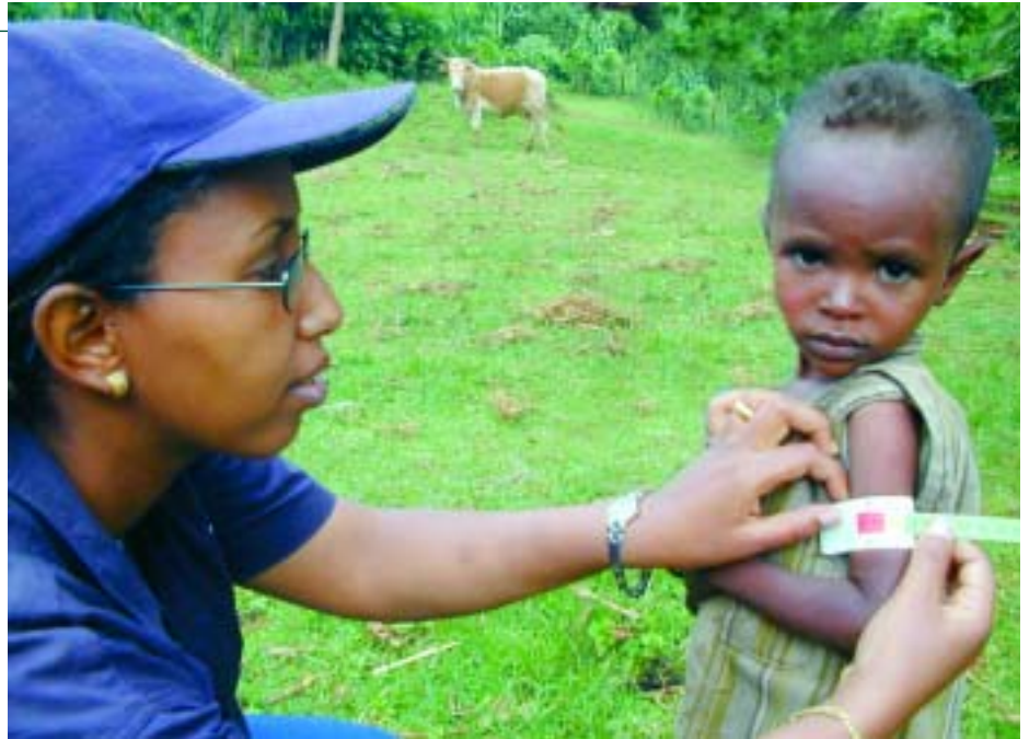
To see who needs food the most, children under five are measured around the upper arm. In a typical village in southern Ethiopia's crisis zone, 18 of 26 children were malnourished, with six severely so.

To go to Ethiopia in March as the crisis there deepened was to travel more than miles. Lutheran World Relief (LWR) joined Catholic Relief Services and Africare, the largest African-American charitable organization assisting Africa, in a journey that took us far from the centers of world power. Our mission was to a destination chosen out of humanitarian concern and Christian compassion.