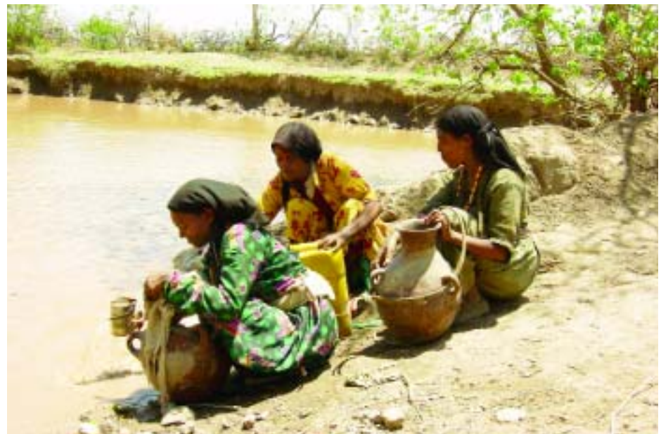
This pond is the last source of water in the area and therefore vital for people and their livestock.

One end of our journey were households in central Ethiopia that may manage to stand up to poverty in normal times but now find themselves brought low by hunger and by the diseases that travel in its wake.