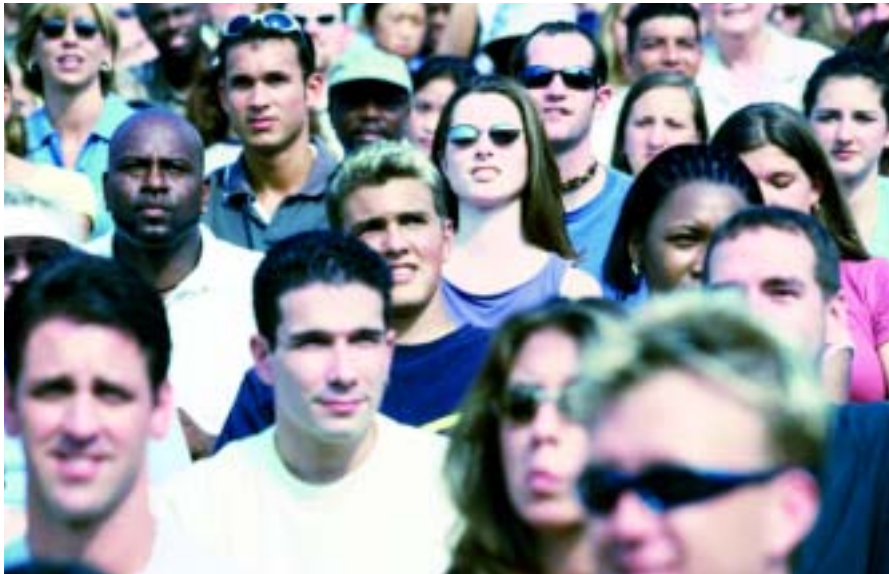
Most of the "unchurched" people polled said they would appreciate a personal invitation to a church from a friend or relative.